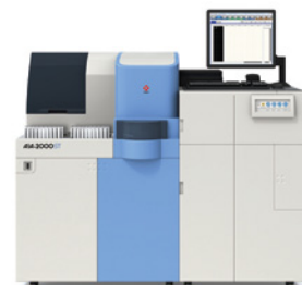
AIA-2000 200 Tests Per Hour

AIA-900 is also available as 9 tray and 19 tray sorter models.