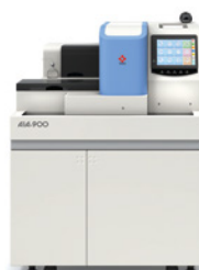
AIA-900 90 Tests Per Hour

AIA-900 is also available as 9 tray and 19 tray sorter models.